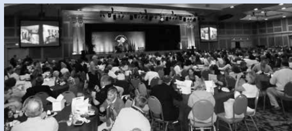
Hundreds of attendees watched the slide show offered by the UMV MRC at last year's national Summit.

Your staff gathered photos from their counterparts across the U.S. to create a special MRC 10th anniversary slide show. Original music selections were provided by Zac Cataldo and Black Cloud Productions. Dr. Mitchell Shuldman of UMass Lowell compiled the photos, music, and captions for the final piece. The six-minute video was displayed on the first day of the annual Integrated Summit in 2012. You can see the video on YouTube from this link: http://umvmrc.org/latestnews/UMV-MRC-on-TV.htm