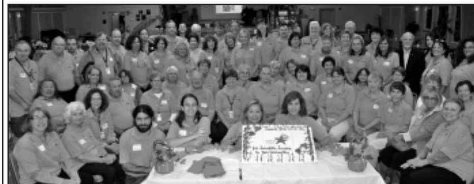
Ninety of our members joined us to cap off September as National Preparedness Month last year with a special volunteer appreciation event. Thanks for your service!