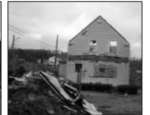
Scenes of devastation remained weeks after tornadoes ripped through Western MA.