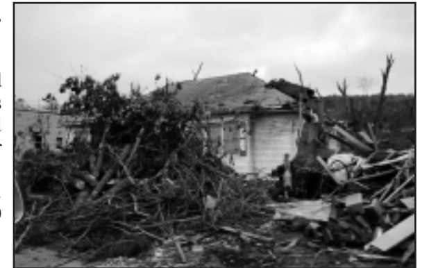
One of the many homes in Monson destroyed by the tornadoes that ravaged the area.

Hundreds were rushed to emergency shelters because their homes had been destroyed. Power outages were rampant; nearly 50,000 customers lost electricity. President Obama declared Greater Springfield a federal disaster area. Governor Patrick activated 1000 National Guard troops for rescue and recovery efforts. Hampden County experienced its first EF3 (Enhanced Fujita Scale) tornado on record; one of only 8 in state history. Damage estimates exceeded $140 million.