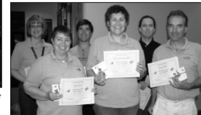
Some of the ten members who volunteered at shelters in the Springfield area gathered July 25 to 'Dine and Debrief,' providing input for an After-Action Report with our gratitude.

Ten UMV MRC volunteers cared for residents at shelters in Springfield and West Springfield. Their input was welcomed at a 'dining and debriefing' event in July. UMV MRC staff thanked these dedicated members for their service, and gathered their comments for an After-Action Report. We hope that the lessons shared by all responders will strengthen our local and state response capabilities for any future events.