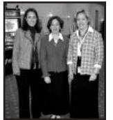
Mass. Health Officers Association

...and four information sessions in the Fall.