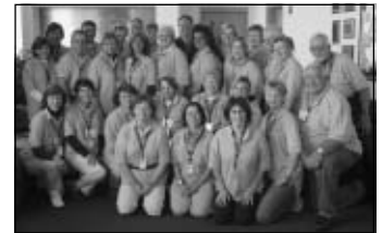
UMV MRC members supported an EDS clinic simulation in Lowell.

Otis - When Camp Edwards on Cape Cod opened its doors to 235 evacuees, MRC units from across the state were eager to provide service. Eleven members of our unit provided care at inoculation clinics, offered administrative support, wrote prescriptions, and served as camp nurses.