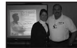
Our first class on Bloodborne Pathogens, PPE and Scene Safety was well received.