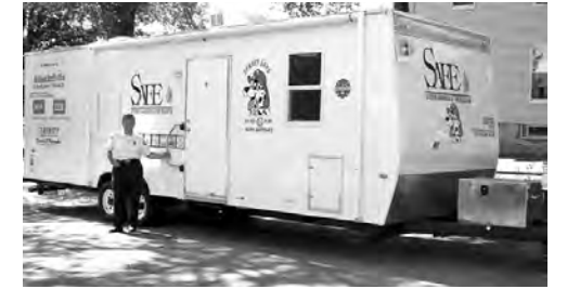
The Lowell event collaborated with the Lowell Fire Department through a tour of their fire safety trailer.

In support of national priorities for preparedness, the UMV MRC partnered with regional health departments to kick off a series of 72-hour emergency kit events for local residents.