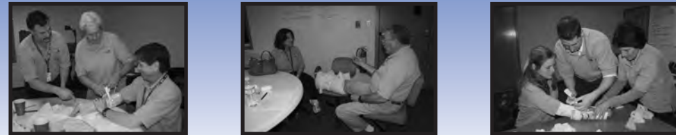
Members filled our debut First Aid class immediately.