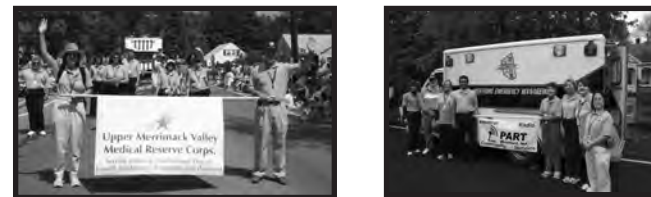
We walked in major parades, while collaborating with response partners.