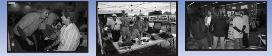
We supported a dozen fairs across the UMV.