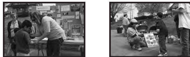
Our first collaboration with the YMCA, for Healthy Kids Day in Lowell, was family-friendly.