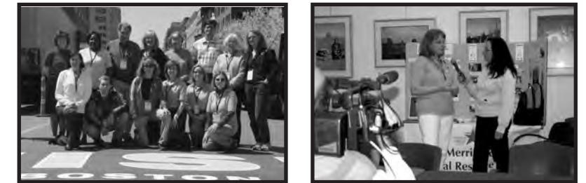
Several events drew media coverage, including our medical work at the Boston Marathon.