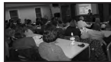
Our first "ICS for EDS" class drew an enthusiastic crowd.