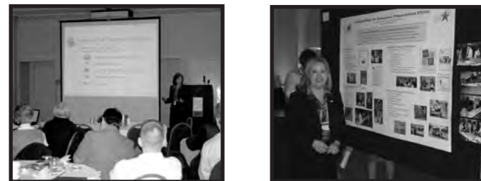
The staff filled leadership roles at state and national conferences.