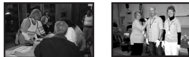
Members provided most of the staffing at flu clinics, run as ICS exercises.