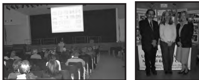
The public was invited to talks on MRSA and Pandemic Preparedness.