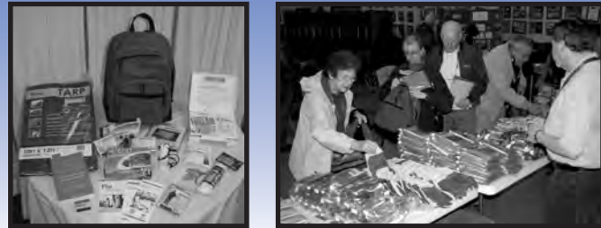
Our unit launched a series of 72-Hour Emergency Kit Events across the region.