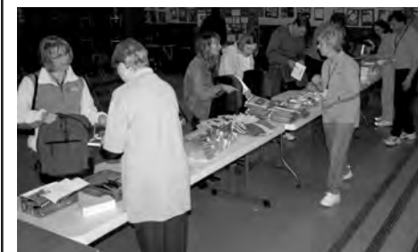
Westford residents built their kits at the April kickoff, assisted by MRC volunteers.

MRC volunteers were on hand to help residents build seventy kits at the April 2008 debut in Westford. Some residents realized that the kits would make great gifts, and purchased extras for family members and friends.