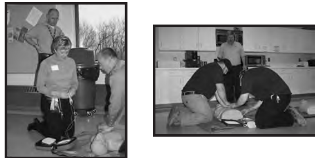
We taught CPR/AED classes for municipal employees, and for our members.