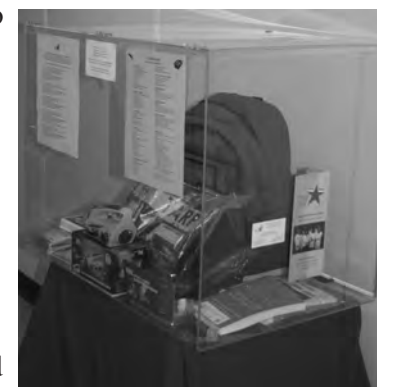
Sample kit in plexiglass display with signage.

MRC members are urged to ensure that their own family is prepared, so they will be better able to help their community in case of a disaster. If you do not have a kit, please sign up for one of our events, or take the responsibility to build a kit on your own. Remember: Being Prepared Just Makes Sense!